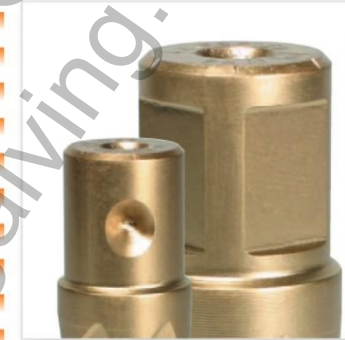
Counterbore for RotaQuick® Weldon